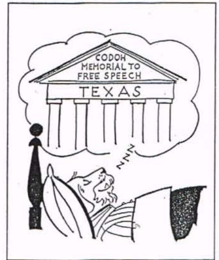
Sweet Dream for a Gay Old Revisionist Dog

CONFESSIONS OF A HOLOCAUST REVISIONIST, the full second edition. Finished at last (almost) with about 600 manuscript pages. So close to finished that I've queried 21 New York City publishers to see if there's any mainstream interest in the book. A two-page query letter, some press clippings, and one chapter titled "God Bless The Rabbis."